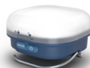
Glow Recharge Blue Art.no 38507