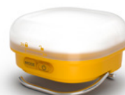
Glow Recharge Yellow Art.no 38508