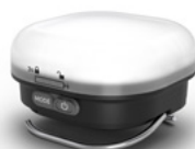
Glow Recharge Black Art.no 38506